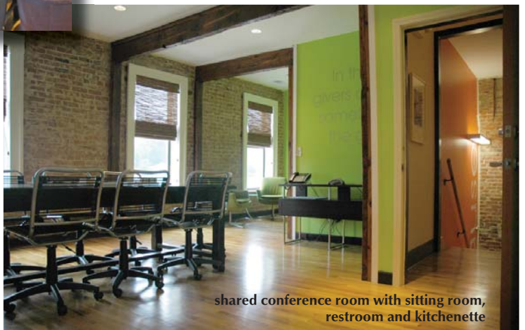
shared conference room with sitting room, restroom and kitchenette